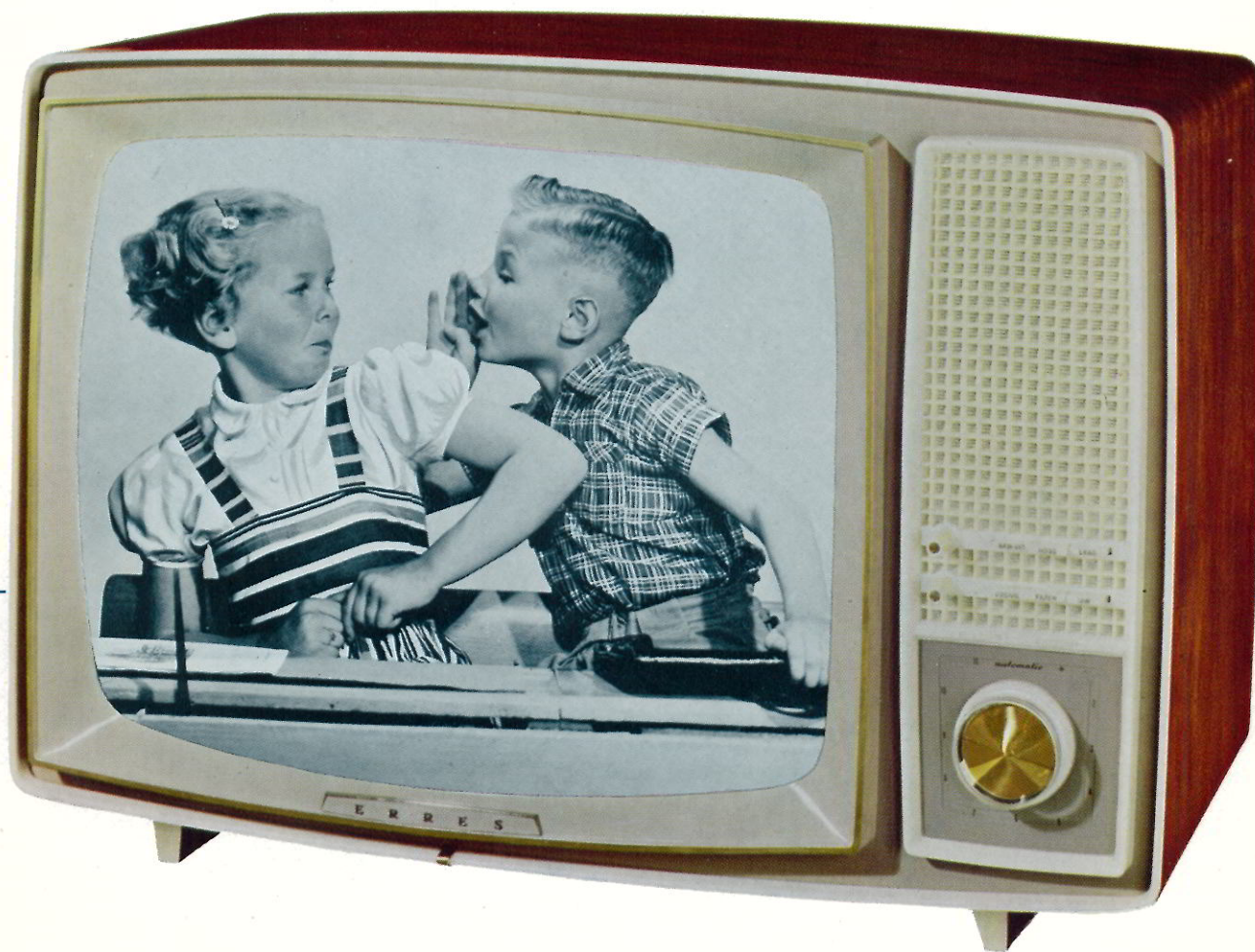
model TV 5626 28" x 19 \frac{1}{2} " x 12"